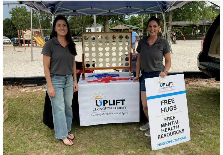
National Night Out- Batesburg/Leesville