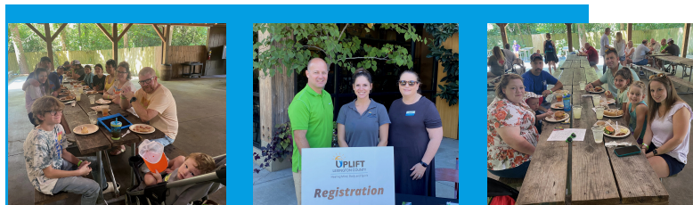
Uplift Family Fun Day